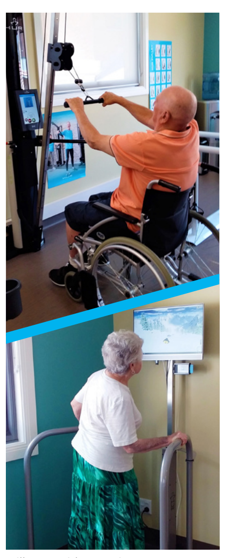
Village residents using HUR Australia equipment